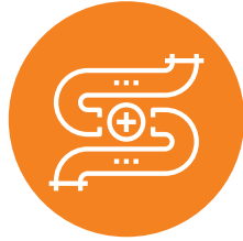
Pipelines & Pipeline Blocks